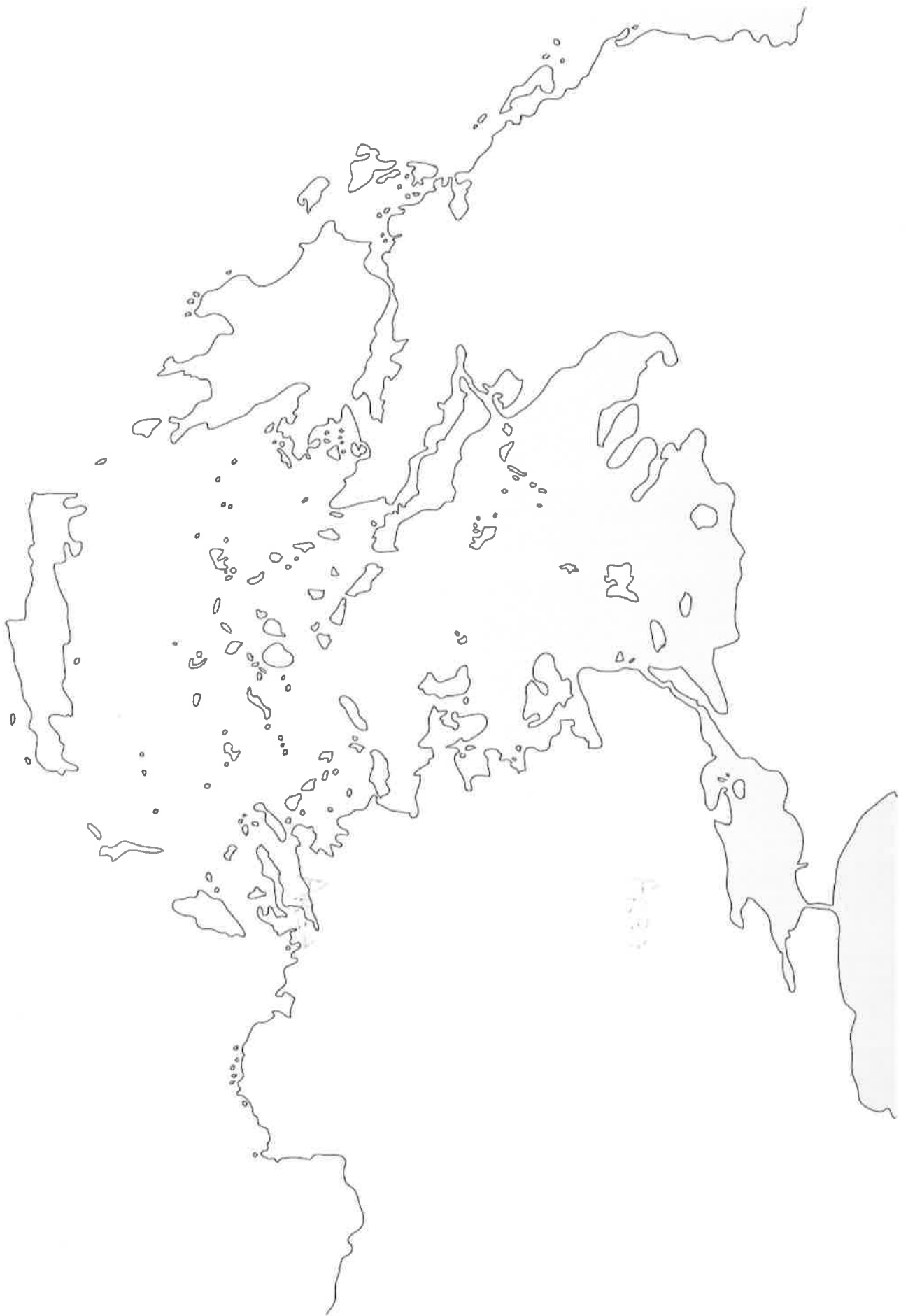
AREA OF ANCIENT GREECE